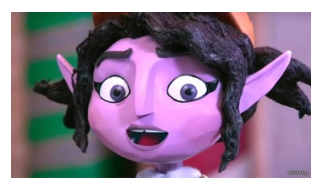
The Animated Elf wearing Jewish Payot sideburns (these are for Jewish males only)

I suppose if you watch this trailer, you'll get a pretty good idea of what is in store for eight nights, all courtesy of a typically heavily Jewish cast and production team, which I won't even describe because it's right out in plain sight.